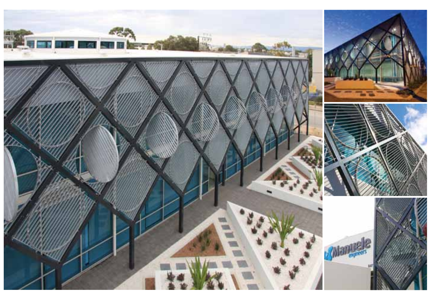
Manuele Engineers Steel Facade Building, North Plympton South Australia

The judges commented that both entries display great innovation in achieving the architect's design. Close collaboration with the stakeholders ensured the vision of the buildings were a success. The Manuele Engineers Building highlights successfully the melding of galvanizing with paint to produce a striking visual statement. The Fustal Stadium showcases a dynamic structure complementing the tropical landscape.