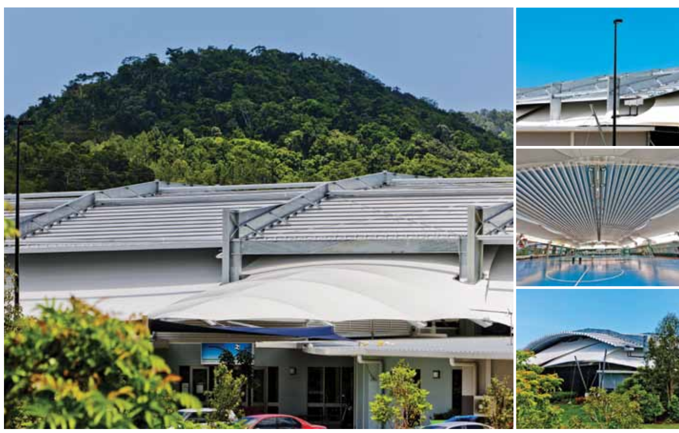
Futsal Stadium, Cairns Queensland