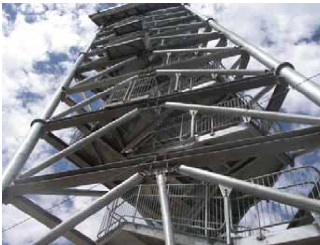
So much steel to protect...