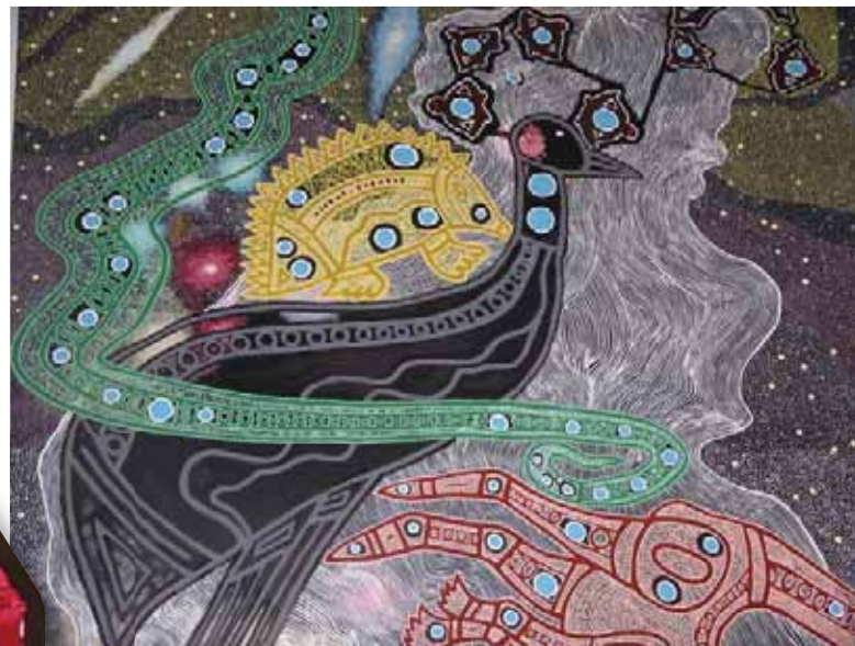
Dreamtime at the Gravity Discovery Centre

The Cosmology Gallery also provides visitors with an insight into the way different cultures view the origin of our Universe. There is a special focus on Dreamtime cosmology which looks at the way indigenous Australians view the origin of the Universe.