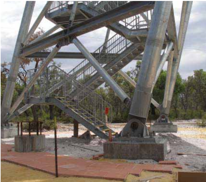
The hinged base of the Leaning Tower

Checker plate was used on the walkways and platforms for statutory compliance as well as making access slightly easier for all types of footwear. The balustrade system was also increased in height to provide a greater feeling of security for users of the Tower.