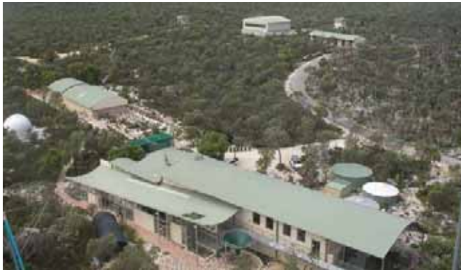
A view from the top of the Leaning Tower