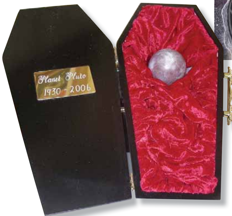
No longer considered a planet - Pluto laid to rest! The selection of materials for the GDC will hopefully give it a longer lifespan.