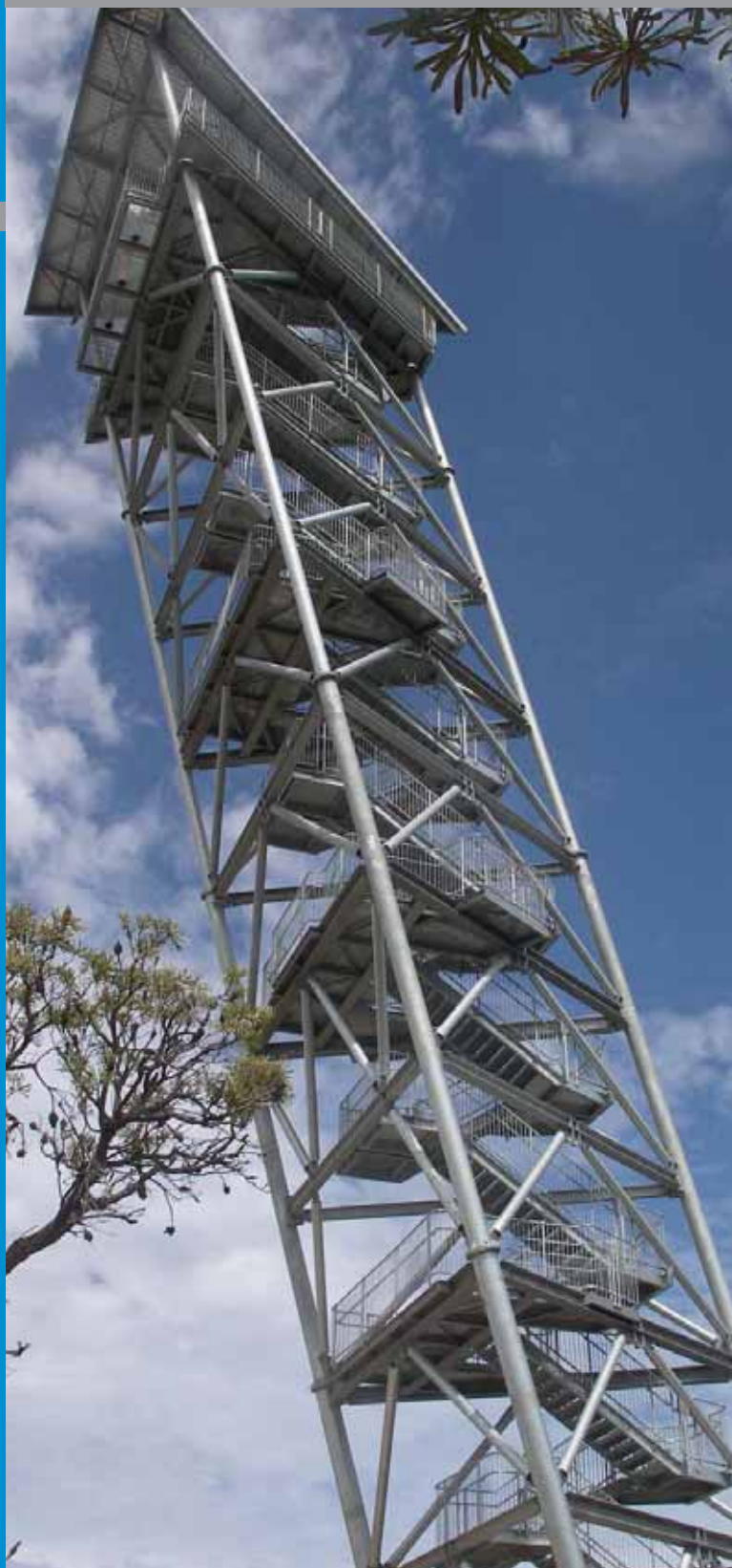
Leaning Tower of Gingin, Gravity Discovery Centre – Gingin, WA

Corrosion control has a big part to play in making sure that assets provide a satisfactory return on their investment to the community. Durability and low maintenance mean that financial reserves are not expended unnecessarily and to the detriment of future investment. Also, durability is a key component of sustainability – the longer an asset lasts, then the less natural resources and energy are required to replace it.